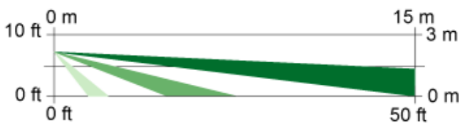
Side View Standard Broad Coverage: 9 m to 15 m x 15 m (30 ft to 50 ft x 50 ft)