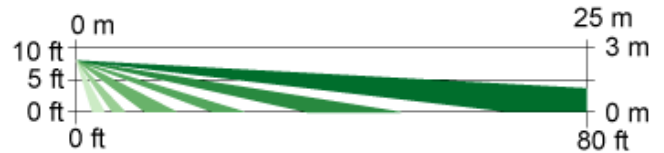
Side View Optional Barrier Coverage: 15 m to 25 m x 5 m (50 ft to 80 ft x 16 ft)